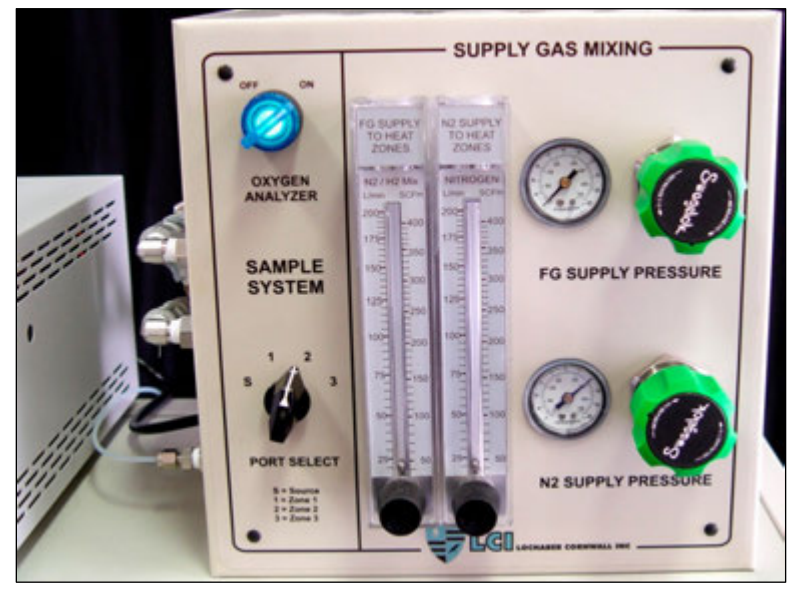
Figure 3. Turn Sample System ON and select Port