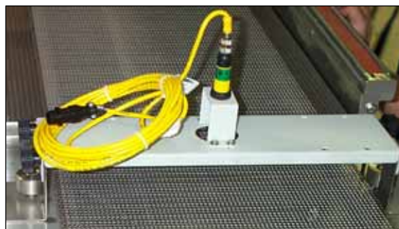
Figure 2. Product Sensor

The cutoff distance is fixed (see Table 1). Objects lying beyond the cutoff distance usually are ignored, even if they are highly reflective. However, it is possible to falsely detect a background object under certain conditions. False sensor response will occur if a background surface reflects the sensor's light more strongly to the near detector (sensing detector) than to the far detector (cutoff detector). The result is a false ON condition. To cure this problem, angle the sensor slightly so the background does not reflect light back to the sensor.